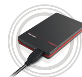
F310S USB 3.0 External Backup Hard Drive