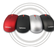
Lenovo 500 Wireless Compact Precision Mouse