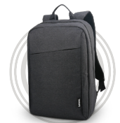
Lenovo 15.6" Laptop Casual Backpack B210